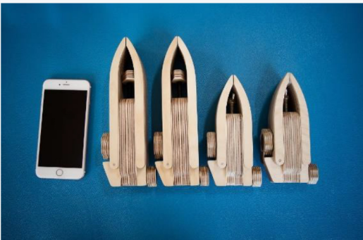
(i-phone/Middle Pony/Mini Pony)